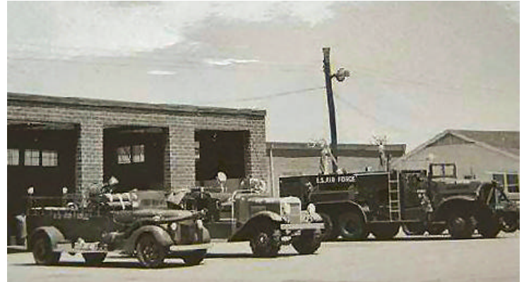
“Class 500 & 750 Pumpers and Type 0-5 Crash Truck” at Craig AFB Fire Station in Alabama (1949).

That’s a wrap for this quarter. I enjoy the networking with each one of you.