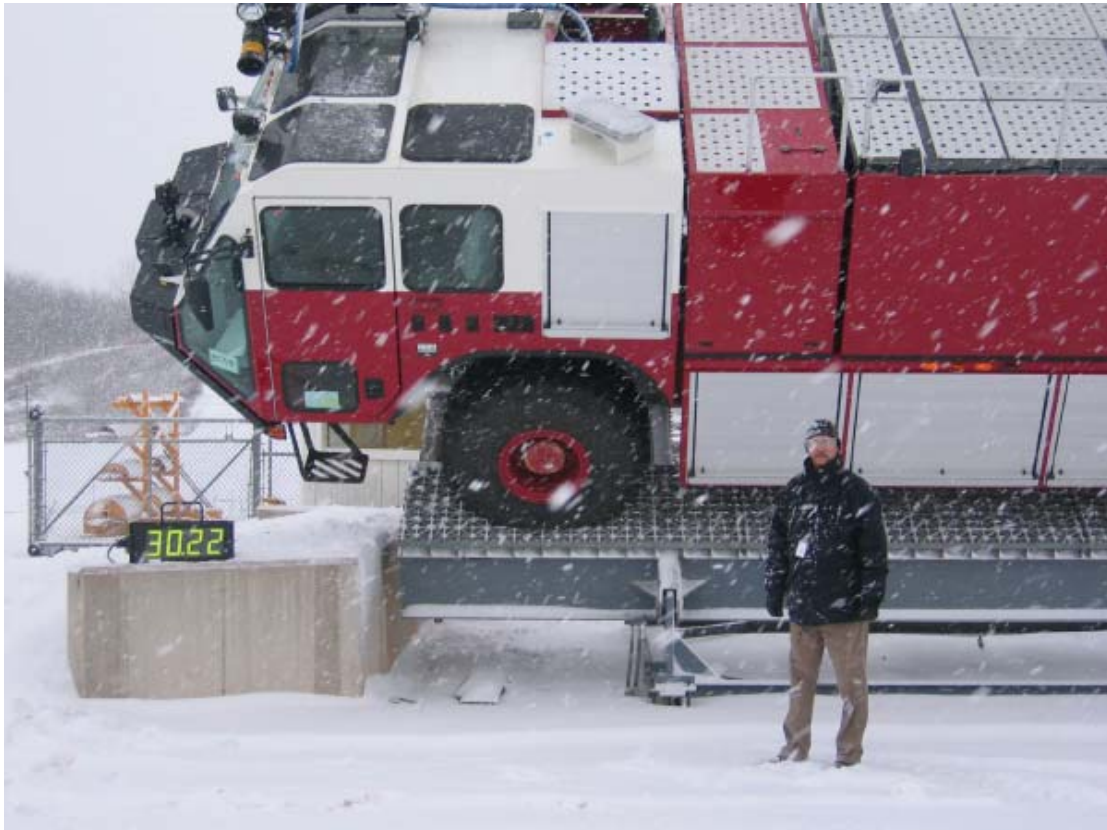
Mr. George Hall, HQ AFCESA/CEXF (AF Fire Protection Office) observing the 30 degree tilt table test for the AF's newest Crash Truck - the Oshkosh TI-3000 in Oshkosh WI. George conducts first article testing for every type of fire truck bought by the AF.